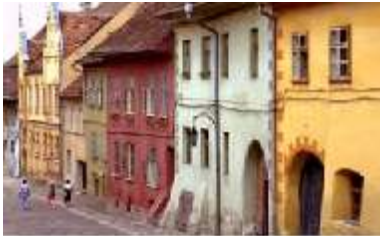
Sighisoara - medieval houses

Bucharest City Tour, (including the Palace of Parliament, Village Museum, Church of the Patriarchy, Revolution Square) etc. Drive to Sibiu, through Pitesti and Ramnicu Valcea, on the way visit the Cozia Monastery (14th century). Accommodation in a 3* hotel.