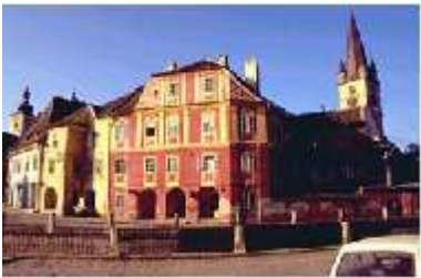
Sibiu - The Little Square

Breakfast. Morning tour of Sibiu (Cultural European Capital in 2007). Drive to Sibiul village and visit the Glass Icons Museum. Continue east to Biertan village and visit the village's fortified church. Continue to Sighisoara. Visit Sighisoara, UNESCO World Heritage site. Accommodation in a 3* hotel.