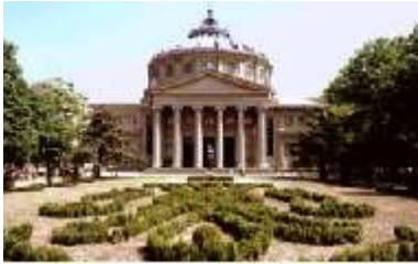
Bucharest - Romanian Atheneum

Pick up from Bucharest Airport. Transfer to a 3* hotel. (Air-conditioning, cable TV, breakfast included, in the Bucharest downtown).