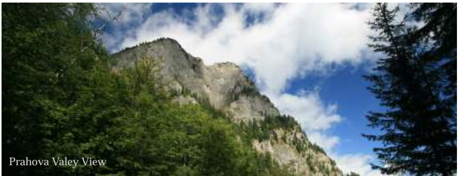
Prahova Valley View

Breakfast. Visit the Pele Castle, the former summer residence of the first King of Romania, Prince Carol of Hohenzollern Sigmaringen. Drive to Bucharest. Transfer to Otopeni Airport.