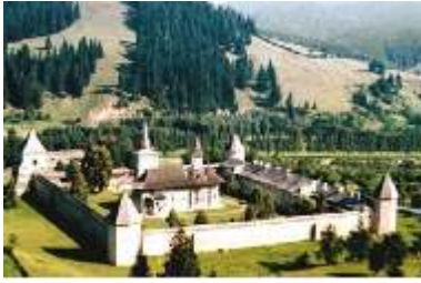
The Sucevita Monastery

Breakfast. Start visitation of the Painted Monasteries (UNESCO World Heritage sites) with Humor, Vorone , Moldovi a. Lunch at the Bucovina Restaurant. Continue with Sucevita and visit the Black Pottery workshops at M rginia. Drive to Gura Humorului. Accommodation in a 3* hotel.