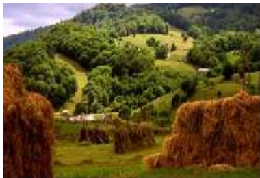
The Bargau Pass

Breakfast. Drive north to Târgu Mureş with orientation tour. Continue north to Bistriţa, then turn east to Vatra Dornei; Accommodation in Câmpulung Moldovenesc in a 3* hotel.